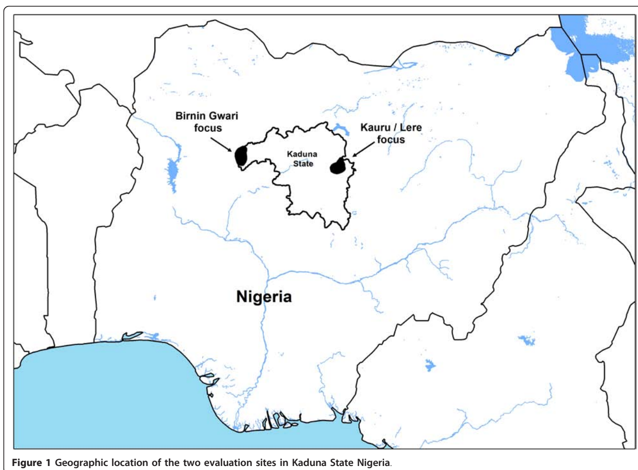
Figure 1 Geographic location of the two evaluation sites in Kaduna State Nigeria.

are located along the rivers of Mairiga and Kwingi in Birnin Gwari and Galma and Karami in Kauru and Lere. The two foci were selected for the following reasons: i) communities in these foci had pre-control epidemiological data; among the areas where large-scale ivermectin treatment was first introduced in Africa were these two foci in Kaduna in which treatment of a sample of the population started as part of a randomised controlled trial of ivermectin in 1988 and 1989, and where skin-snip surveys had been done in preparation for the trial [6,17]. ii) the foci included hyper-endemic villages, i.e. villages with a prevalence of microfilaridermia > 60% [15-17]; iii) the area was located along a river with known breeding sites of Simulium damnosum s.l. , iv) the communities had had 15 - 17 years of annual treatment with ivermectin using the community-based programme since 1991, and subsequently through the community-directed treatment with ivermectin (CDTI) strategy from 1997 with more than 65% treatment coverage.