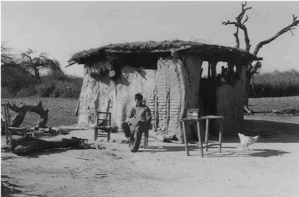
FIGURE 2. Typical residence and environment in the study area.

\geq 3.0 in the univariate analysis. A final model was defined, starting with the factors that were significant in the three group's model. Only those factors that remained in the groups and final models are presented. All the analyses were performed using Stata, Version 4.0 (Stata Corporation, College Station, TX).