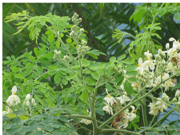
Figure 1 Moringa oleifera tree leaf.

In order to test the efficacy of Moringa oleifera leaf powder, we used an adapted protocol of the European Committee for Standardization (EN 1499) [14] which is designed to evaluate the ability of hand-wash agents to eliminate transient pathogens from volunteers' hands without regard to resident micro-organisms. This procedure is based on the