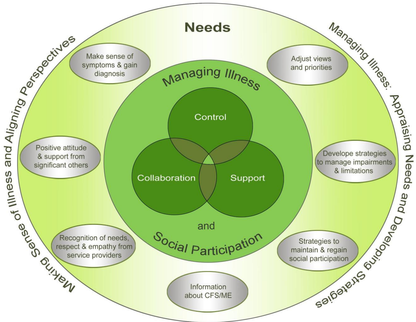
Figure 2 Conceptual framework derived from the core categories of expressed needs of people with CFS/ME for support in managing the illness and social inclusion developed from the data within this systematic review.

macy, further compromised participation in many areas, such as family, work, leisure, health and social care.